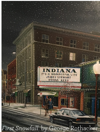
First Snowfall by George Rothacker

In town, you'll hear a familiar voice along Philadelphia Street, the main drag. The crossing signals are all voiced by hometown actor, Jimmy Stewart . A museum in his name is open weekends and runs matinees in its small theater.