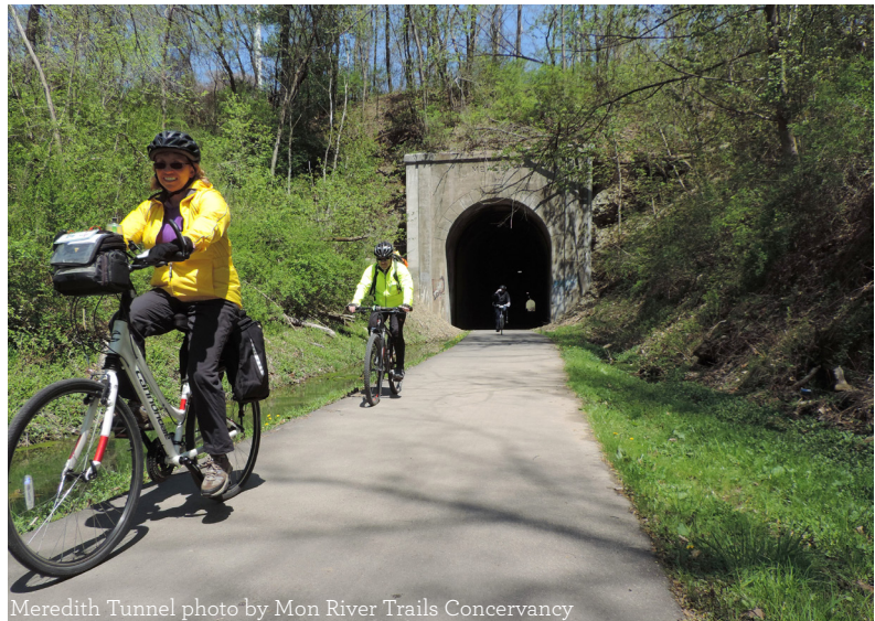
Meredith Tunnel

Easily accessible from Pittsburgh and Cumberland, these Mountain State rail-trails offer solitude and scenery as well as access to West Virginia's most known college town. Bike up to 84 miles on four connected trails, or pick and choose based on your interests.