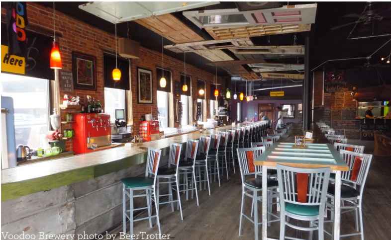
Voodoo Brewery

Go northeast to explore Cook Forest State Park (the Eastern hemlocks are stunning) and Allegheny National Forest . The town of Warren skirts the forest and boasts impressive architecture.